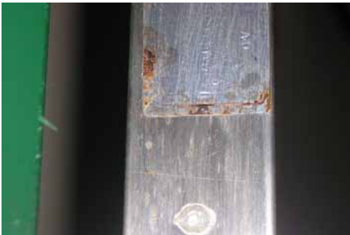
Identification of Fire Doors Class Type