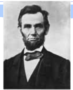
Abraham Lincoln 16th President of USA responsible for the abolition of slavery

"If I had eight hours to chop down a tree, I'd spend six hours sharpening my ax"