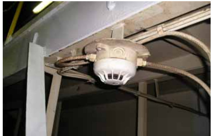
Identification and location of various fire sensors in the E/R between frames, pipes and cables