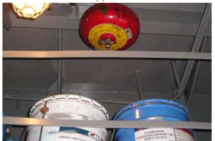
Paint Locker Fixed Fire Extinguisher system