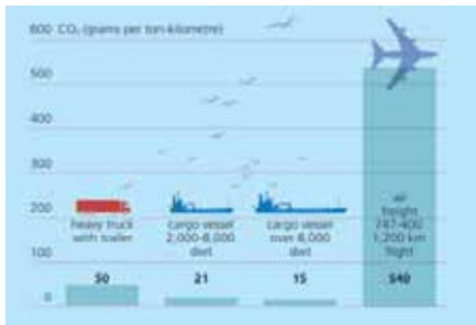
Comparison of CO2 emissions by different transport modes

The major task for the future is to improve the quality of fuel oil supplied to ships by the oil companies, the sulphur content of which is relatively high. Later this year, IMO is expected to adopt a number